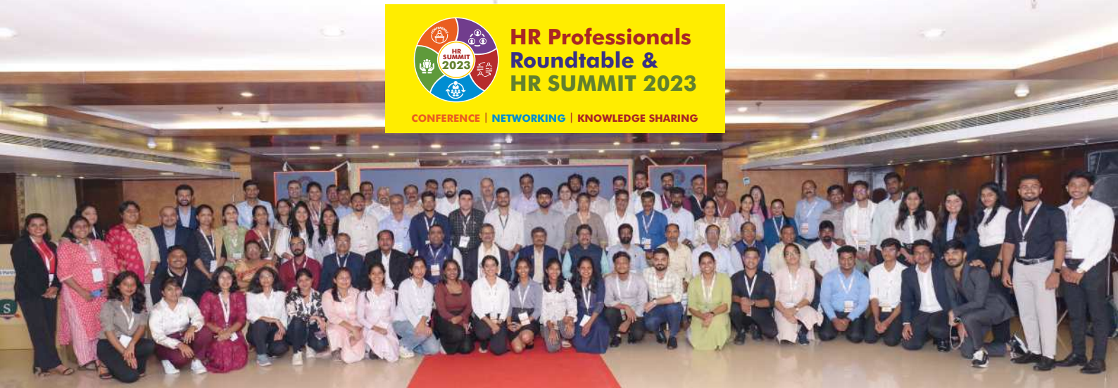
NIPM - Mangalore Chapter Executive Members and HR Summit 2023 Organising Team