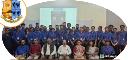
St. Aloysius College (Deemed to be University) Mangaluru