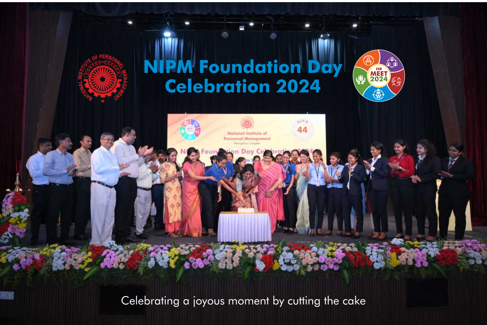
Celebrating a joyous moment by cutting the cake