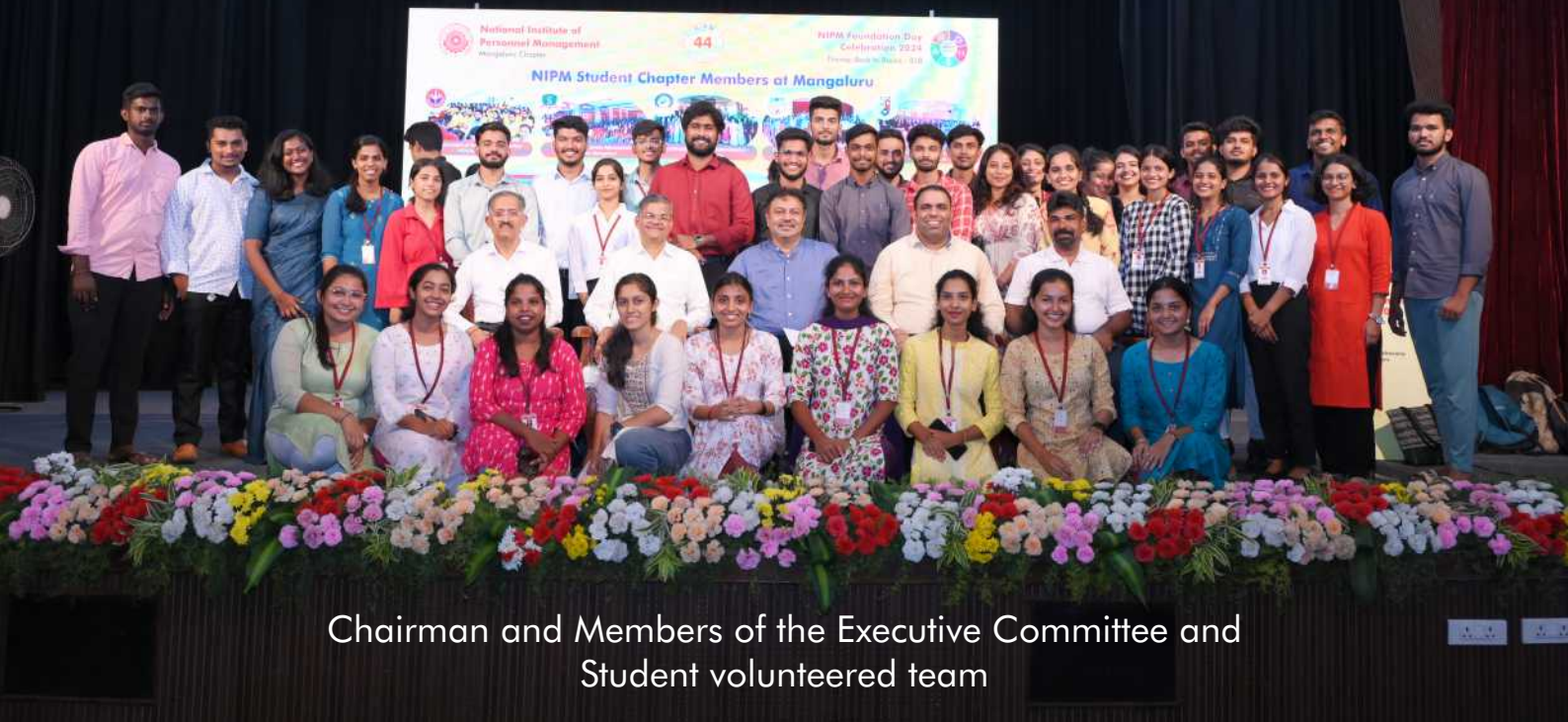
Chairman and Members of the Executive Committee and Student volunteered team