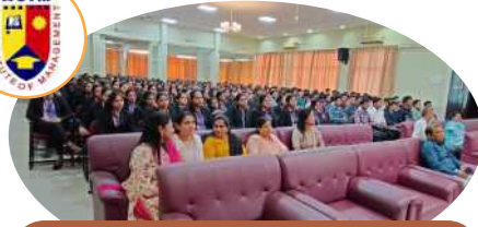
A J Institute of Management (AJIM) Mangaluru