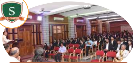
Sahyadri College of Engineering & Management Mangaluru