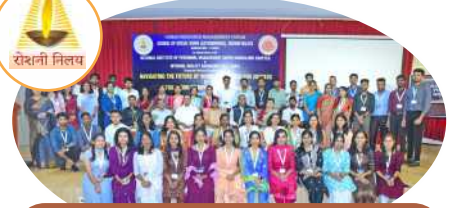
School of Social Work, Roshni Nilaya Mangaluru