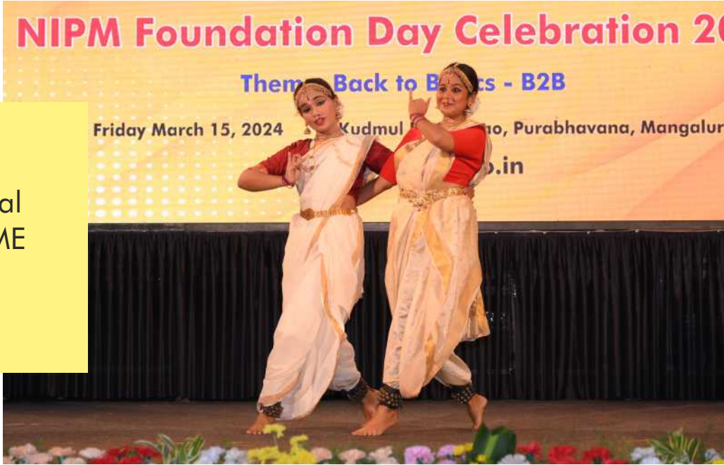
Traditional WELCOME Dance