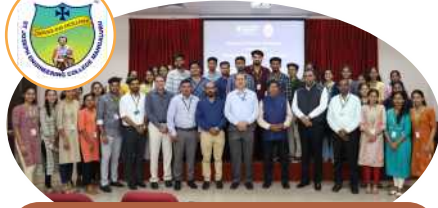
St Joseph Engineering College (SJEC) Mangaluru