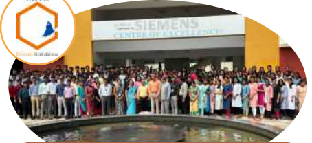
Mangalore Institute of Technology and Engineering (MITE), Moodabhidri