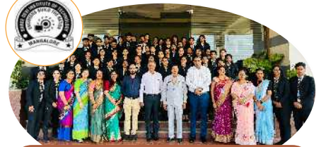
Shree Devi Institute of Technology (SDIT) Mangaluru