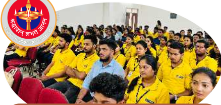
Manel Srinivas Nayak Institute of Management (MSNIM), Mangaluru