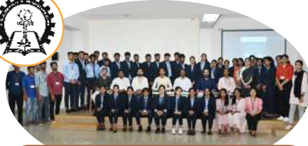
Sri Dharmasthala Manjunatheshwara (SDM) College, Ujire