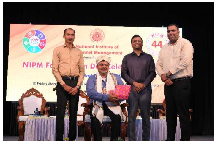
Honouring Chief Guests by NIPM Chairman and Members of the Executive Committee