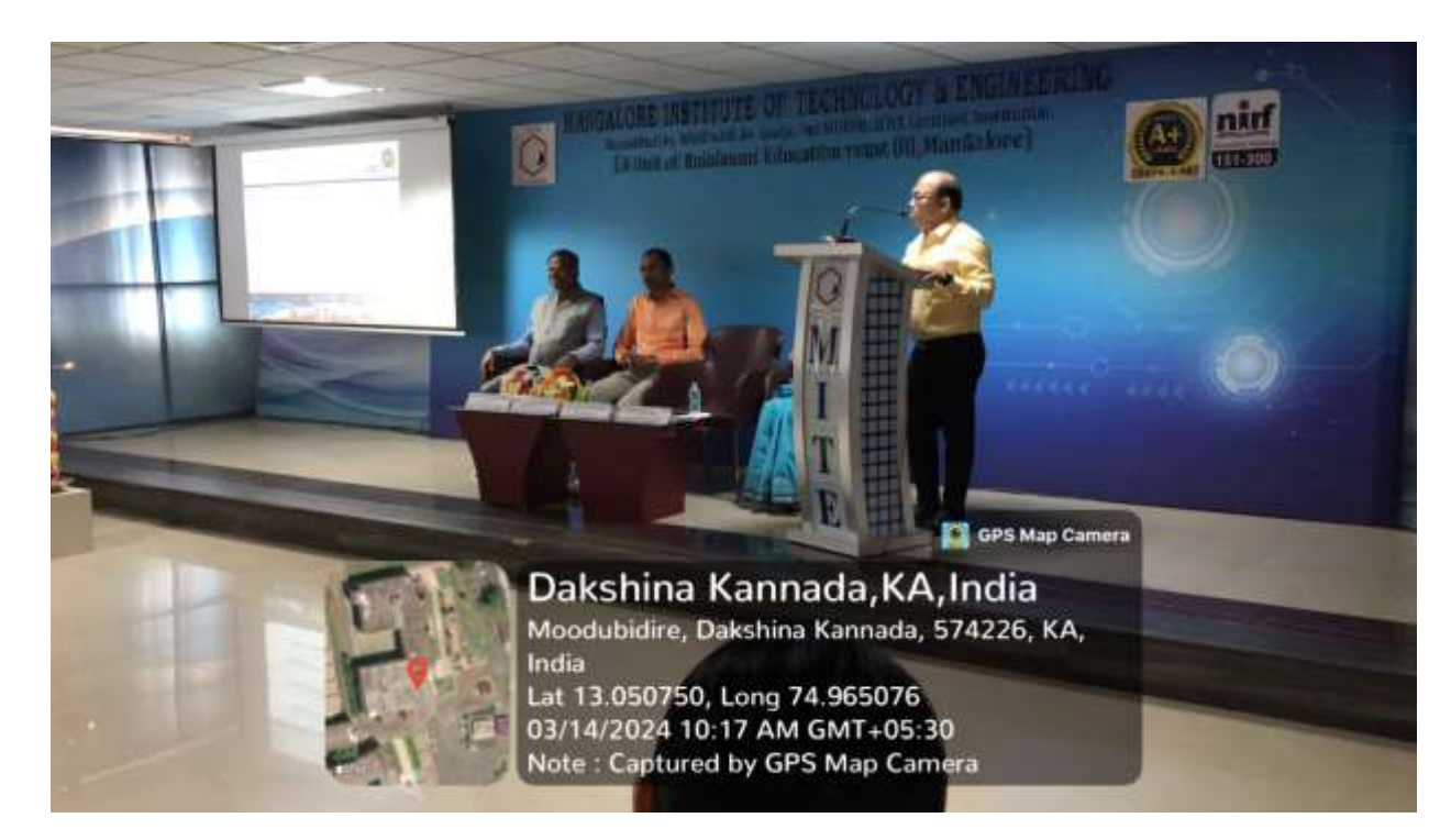
Chief Guest addressing the gathering after inauguration

(A unit of Rajalaxmi Education Trust <sup>®</sup>, Mangalore) Autonomous Institute Affiliated to V.T.U., Belagavi, Approved by AICTE, New Delhi Accredited by NAAC with A+ Grade & an ISO 9001:2015 Certified Institution