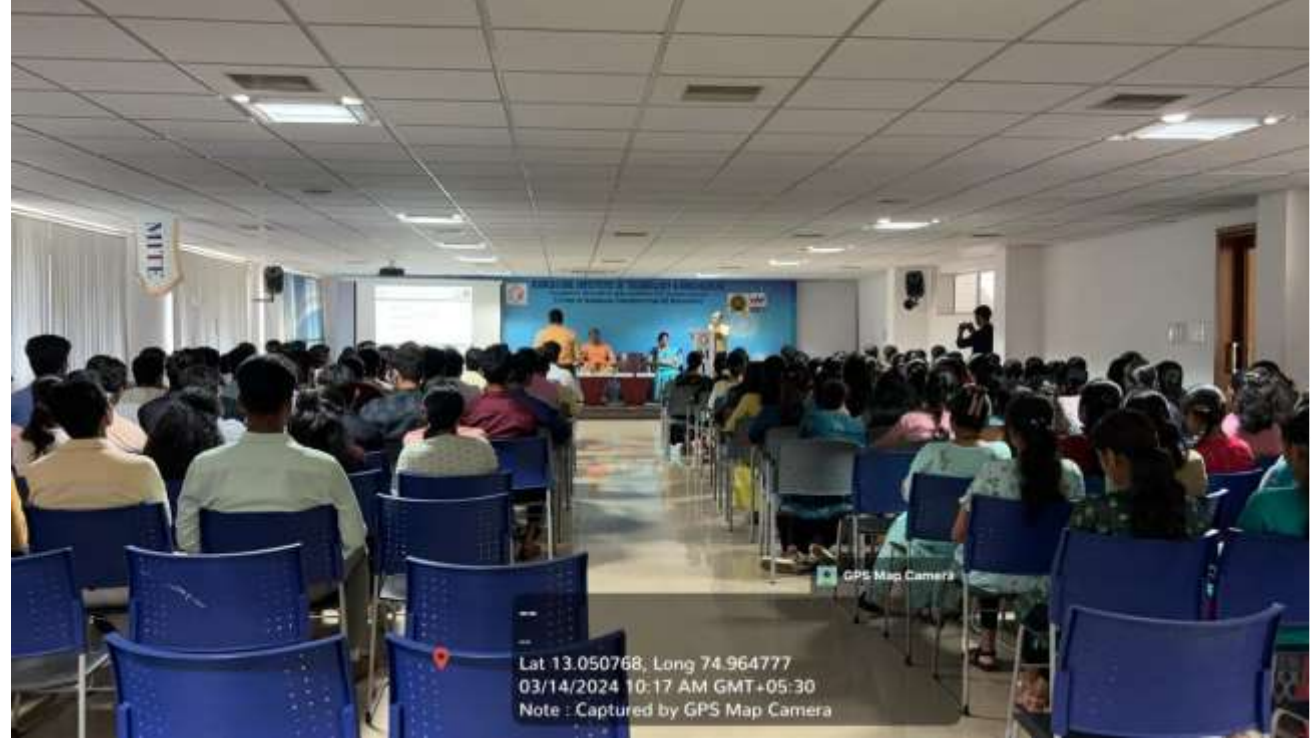
Interaction by the Guests with the students